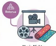
Movie Nights & Fabric Sales