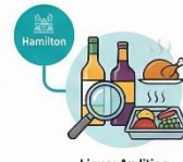
Liquor Auditing & Catering