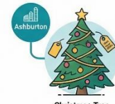
Christmas Tree of Remembrance