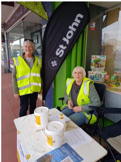
Collecting for St Johns