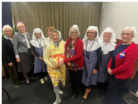
The new Board is installed