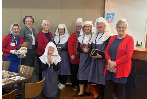
The organisers in costume