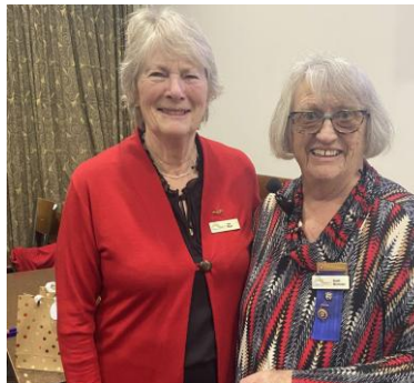
15 and 10 years of service were acknowledged