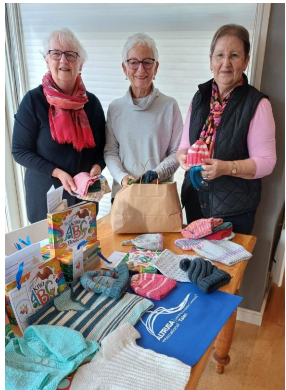
The Literacy committee continue to coordinate packs for Plunket and newborn babes on the Taieri.