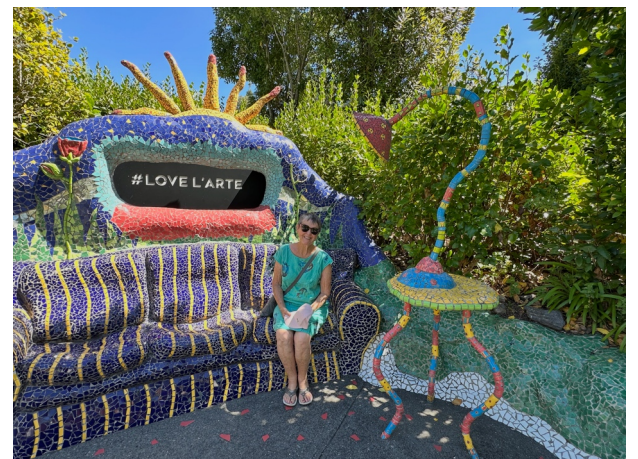
Ros enjoyed both the mosaic art and the coffee at L'Arte Cafe in Acacia Bay, Taupo.