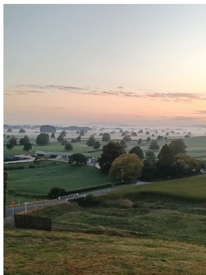
A lovely early morning view on Old Te Kūiti Road, taken by Colleen's daughter