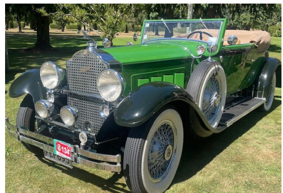
Colleen fancies this 1931 Riley Tourer to go to the supermarket!

Photographed at the Blenheim Veteran car rally