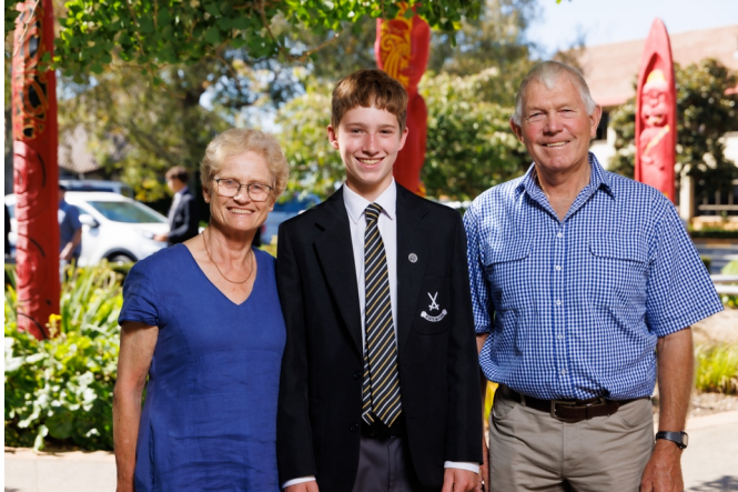
Two of our members were guests at the Grandparent's day at St Pauls College in Hamilton.