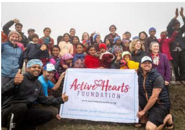
AHF at the clothing distribution in Salme Village