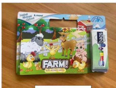
Pad with activities

They could be used in conjunction with Distraction Packs already being made by clubs.