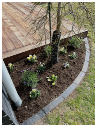
A new garden Colleen created while she was there. I wonder if Izzy helped!