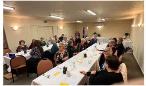
After the meal and now the cake.