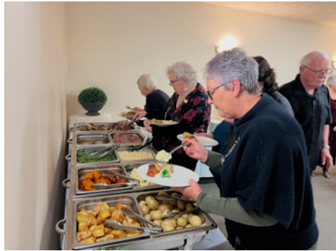
The delicious spread we had to choose from.