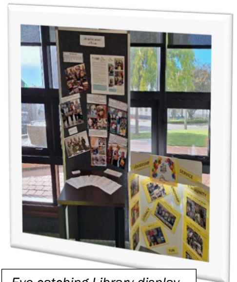
Eye catching Library display.