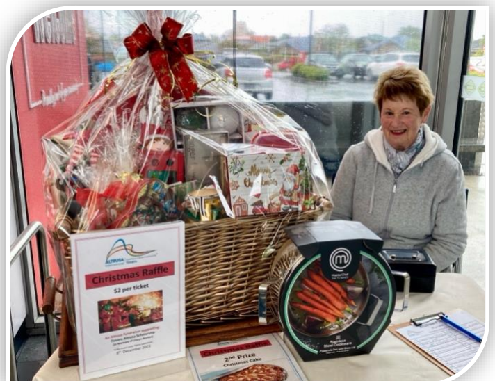
May in selling mode at New World.