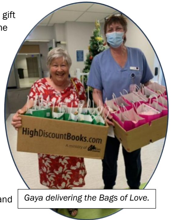
Gaya delivering the Bags of Love.